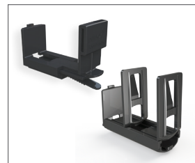
Single & double mounting brackets