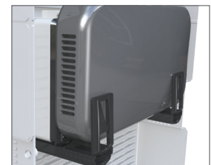
Multiple component mounting