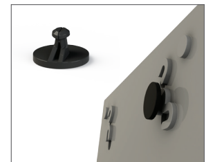
Keyhole mounting bracket