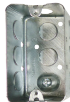
1 x Gang Box