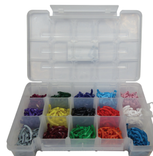
125-1450 Splitter Identifier Kit