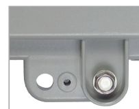
Hex bolt: 125-1013