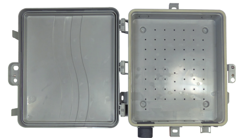
125-1016: blank, w/override lock, gasket, PVC