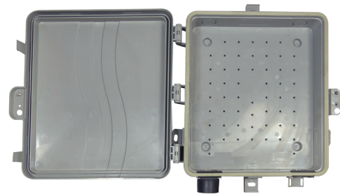
125-1013: blank, w/hex bolt, gasket, PVC