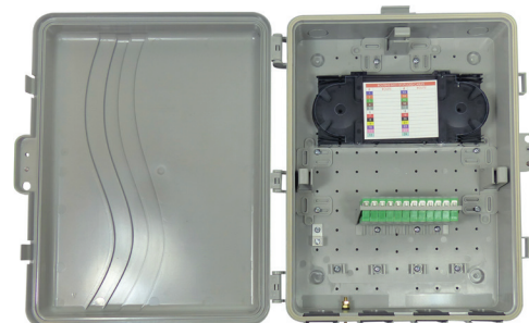
125-1503: 24 SC/APC simplex, 2x12 splice tray, gasket, hex bolt, 4 Hurricane Clips, PVC