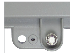
Hex bolt: 125-1502; 125-1503